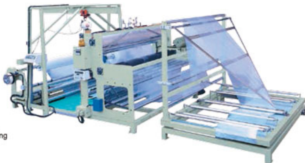
Unwinders for two single sheet PE film