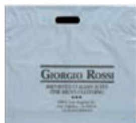
DIE CUT HANDLE BAG